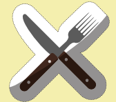
bring your own cutlery