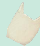
plastic grocery bag