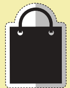
reusable shopping bag