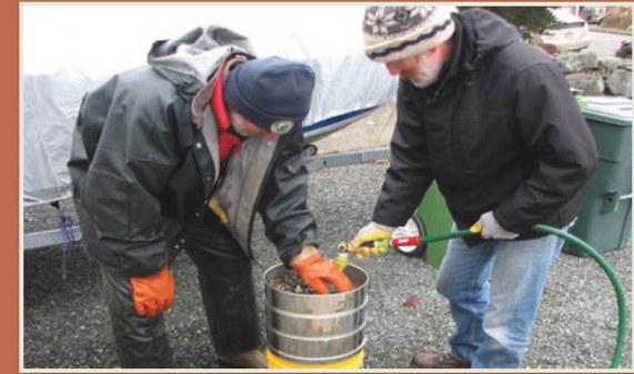
Forage fish spawning surveys