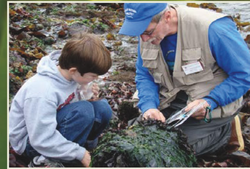
Learning on the beach