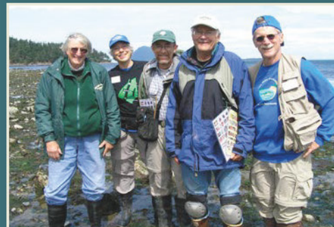
Protecting our shorelines