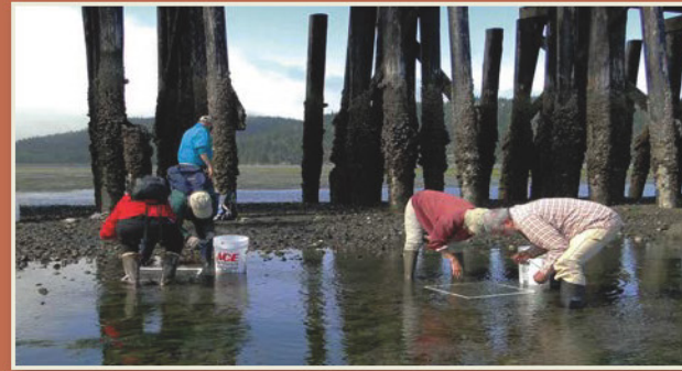
Monitoring shorelines & intertidal zones