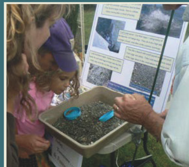
Inspiring the next generation of marine stewards

The beauty and abundant natural resources of Skagit County shorelines and bays call upon those who enjoy it today to protect them for future generations.