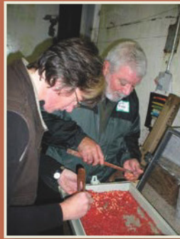
Collecting data for research

Friends of Skagit Beaches supports volunteer projects that monitor local ecosystems, gather data for researchers, and assist local and state organizations to better understand, manage, and restore habitat for fish and wildlife.