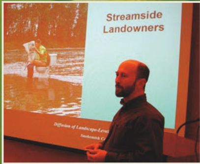
Lectures & classes