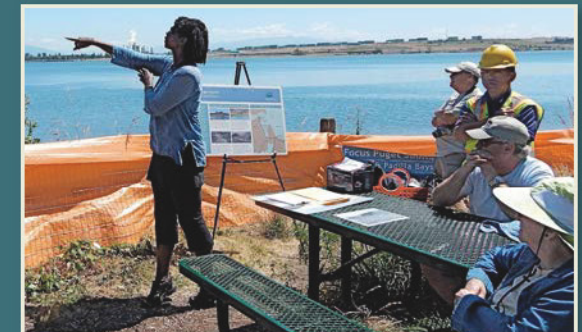
Promoting citizen involvement in environmental restoration