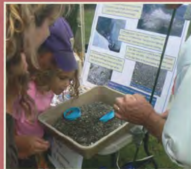
Inspiring the next generation of marine stewards

The beauty and abundant natural resources of Skagit County shorelines and bays call upon those who enjoy it today to protect them for future generations.