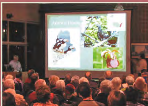
Winter Lecture Series

Friends of Skagit beaches P.O. Box 481 Anacortes, WA 98221 friends@skagitbeaches.org