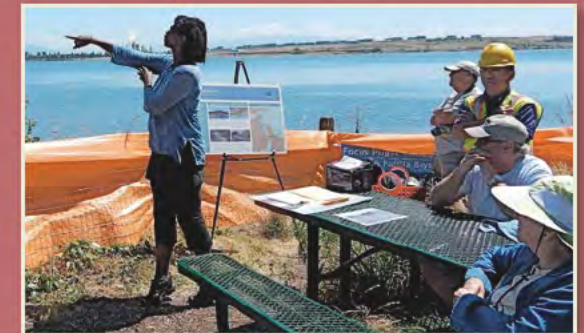
Promoting citizen involvement in environmental restoration