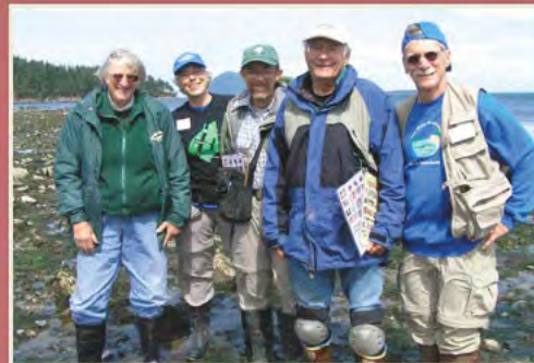
Protecting our shorelines