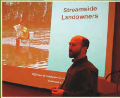
Lectures & classes