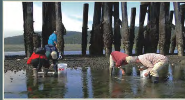
Monitoring shorelines & intertidal zones