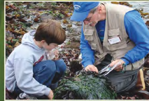
Learning on the beach