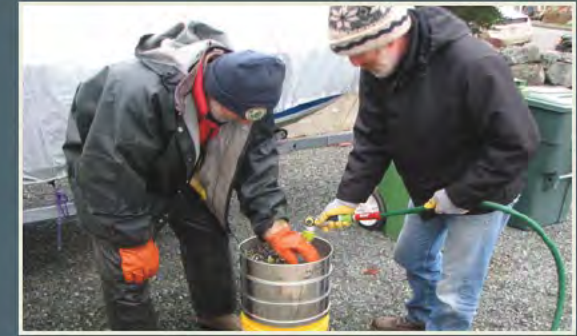
Forage fish spawning surveys