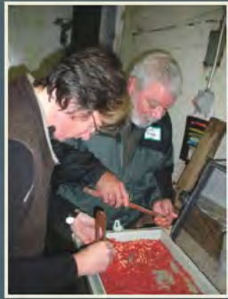
Collecting data for research

Friends of Skagit Beaches supports volunteer projects that monitor local ecosystems, gather data for researchers, and assist local and state organizations to better understand, manage, and restore habitat for fish and wildlife.