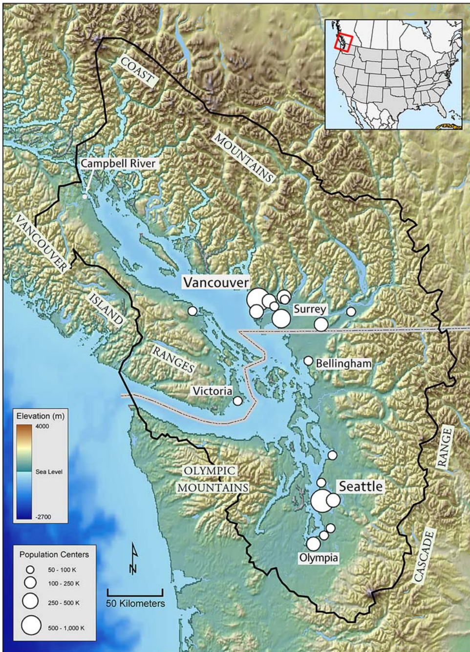
Figure 1. Map outlining the boundaries of the Salish Sea (solid black line), from the mountain tops to the marine water, showing terrestrial topography, marine bathymetry, and the “arbitrary” international border (white-gray dotted line) separating the Puget Sound Basin (United States) to the south and the Georgia Basin (Canada) to the north.

and anadromous fish, over 100 species of marine birds, 26 species of mammals, and thousands of invertebrate species (Puget Sound Partnership 2006; Brown and Gaydos 2007; Puget Sound Action Team 2007). Like other coastal zones around the world, the Salish Sea has been dramatically altered under pressure from a growing human population, conversion of native forest and shoreline habitat to urban development, toxic contamination of sediments and species, and overharvesting of resources (Thom and Levings 1994; Puget Sound Action Team 2007).